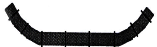
Sandbags are placed along the contour of the slope.

Biodegradable bags are filled with on site soil and bedded in a shallow trench forming a continuous barrier along the contour (across the slope) to intercept water running down the slope.