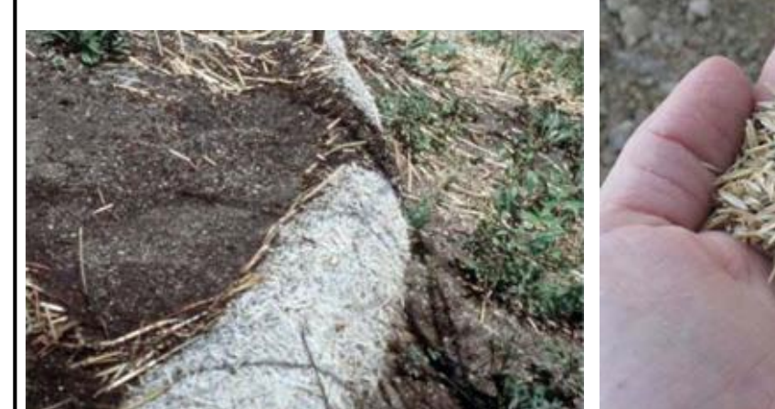
Wattles on a hillslope

The Natural Resources Conservation Service is available to answer your erosion control questions. Call 970.295.5655.